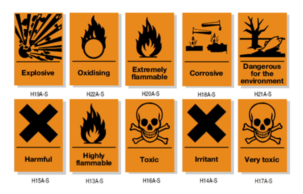
Figure 1: Old chemical hazard symbols.